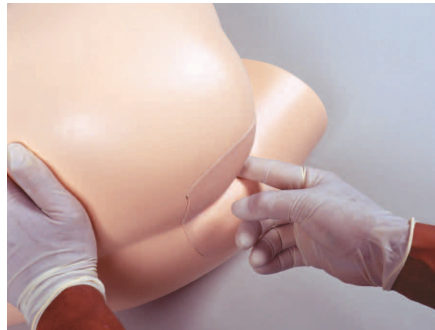
Prostate or endocervix can be palpated.