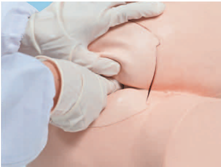
4 interchangeable rectum units for differentiation of lesion types.

High-fidelity sphincter resistance and feeling of rectum wall allows excellent hands-on DRE training before passing on to patients.