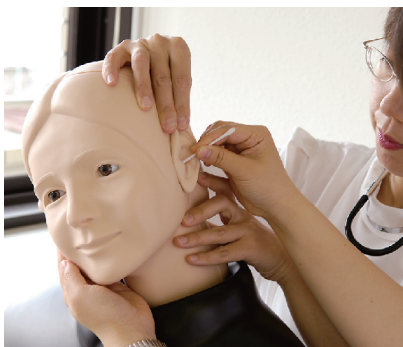
Foreign body removal