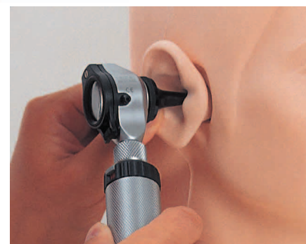
Training with an actual otoscope

Foreign body removal can be practiced using simulated earwax and/or small objects, and a pair of ear models without eardrums.