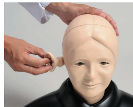
Simple exchange of ear units