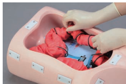
Colon layout can be changed.