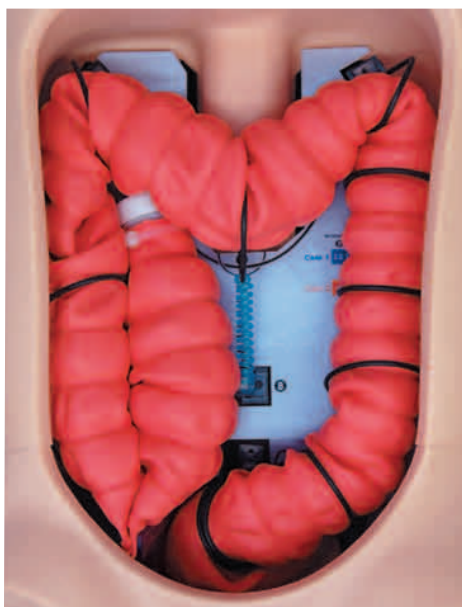
Introductory level 1