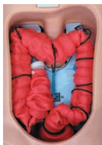
Introductory level 2