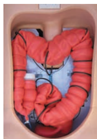
Introductory level 3