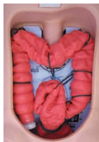
Introductory level 6