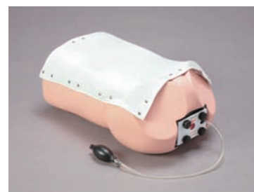
Manual abdominal compression