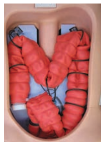
Introductory level 4